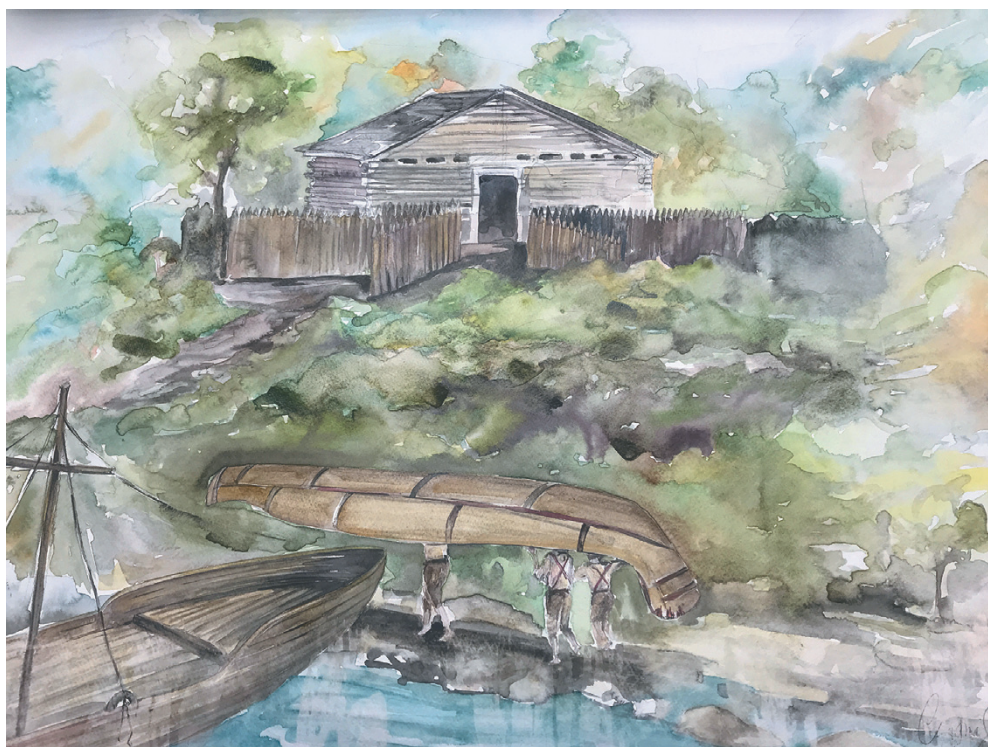
This watercolor image, courtesy of the Historic Association of Lewiston collection, depicts Le Magazin Royal as it would have appeared in the 1720s.

In Western New York, it is not often one gets a chance to celebrate the tricentennial of an historic event. But that's what is happening on Saturday, Sept. 12, at Artpark in Lewiston.